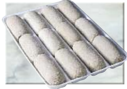
Honey Wheat Demi-Loaf