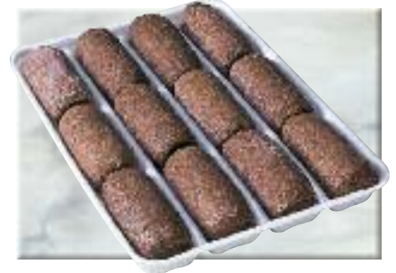
Bavarian Dark Demi-Loaf